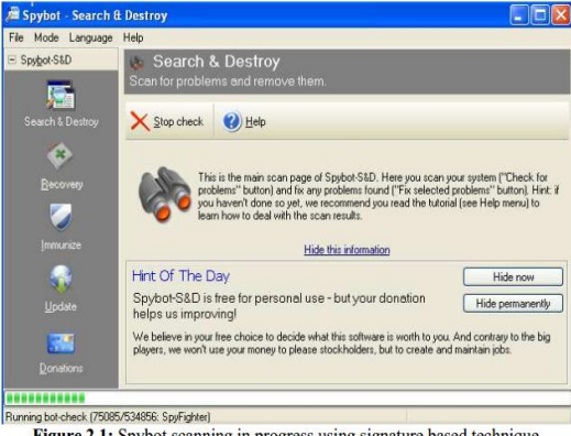
Figure 2.1: Spybot scanning in progress using signature based technique

By pressing check for problem button, spy-bot start doing scanning of whole computer system by using signature technique, in which every file has been matched with the updated database of spywares codes.