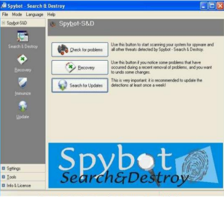
Figure 2.0: Spybot-Search & Destroy Home Window

After successful installation on the home system and performing updates shown following figure.