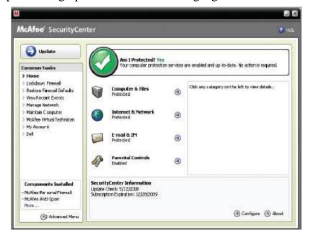
Figure 3.0: McAfee security center Home Window

After successful installation on the home system and performing updates shown following figure.