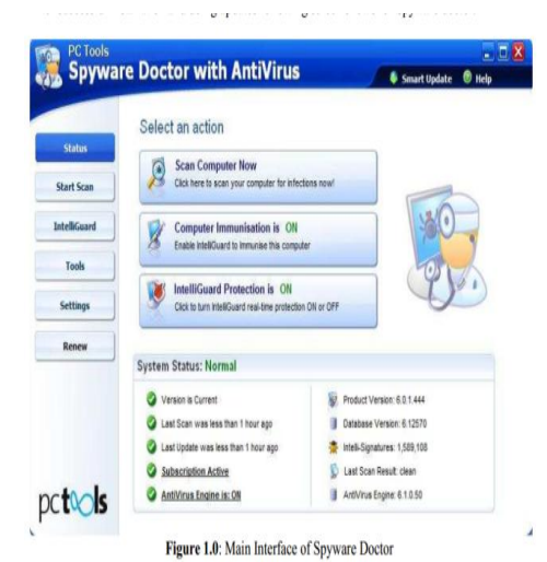
Figure 1.0: Main Interface of Spyware Doctor

After successful installation and doing updates following screen shows for Spyware doctor[10].